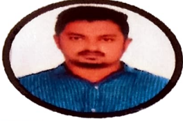
USN-4PS18MBA26 Name-Nagaprabha Company-S2 Consulting service