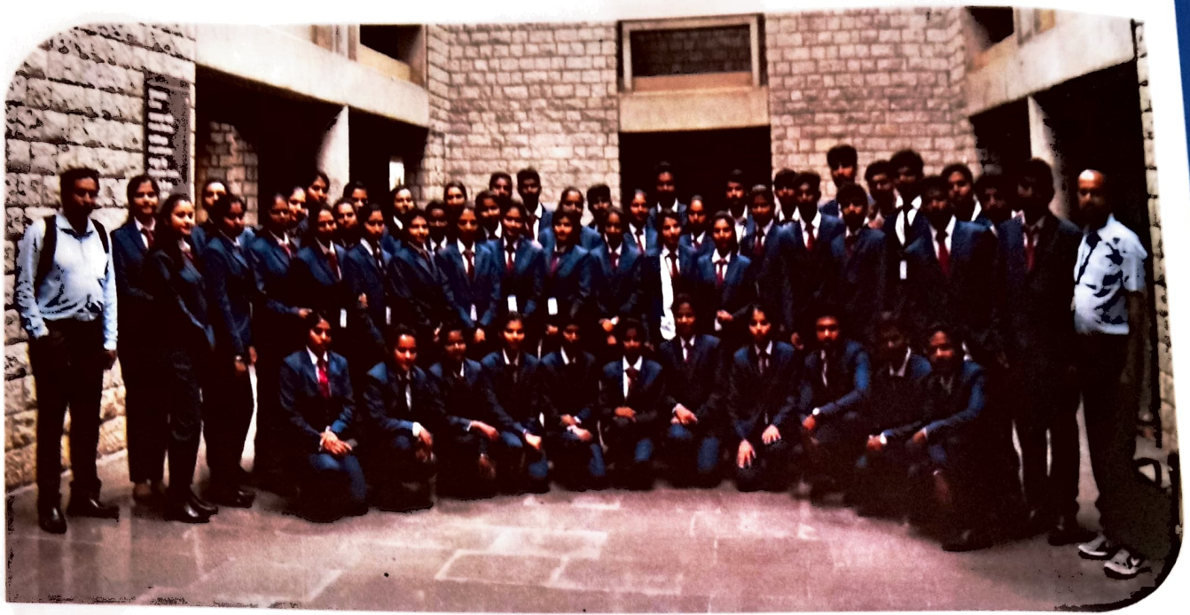
Indian Institute of Management (IIM) Bangalore Visit for II year MBA Students on 17.10.2019 organized by Post Graduate Department Of Management Studies, P E S College of Engineering, Mandya.